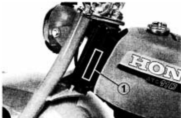
(1) Frame serial number

The frame serial number (1) is stamped on the left of the steering head. The engine serial number (2) is stamped on the crankcase just above the left foot peg.