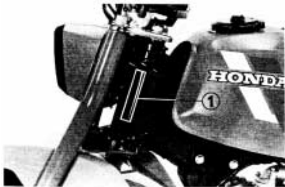
(1) Frame serial number