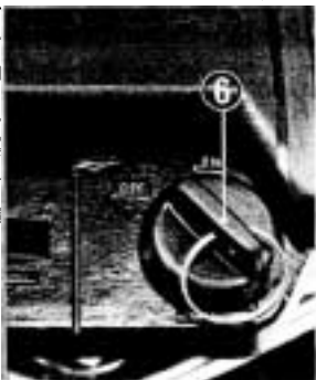
(6) Ignition switch