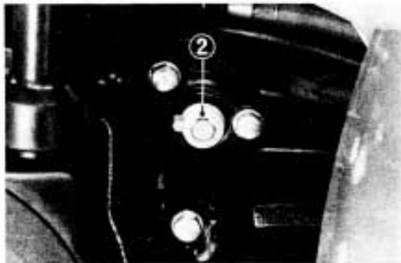
(2) Neutral indicator

The neutral indicator (2) is on the left crankcase cover, just behind the recoil starter. The indicator rotates as the gears are changed. When the indicator aligns with the N mark on the crankcase, the transmission is in neutral.