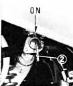
(2) Fuel valve