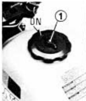
(1) Vent lever