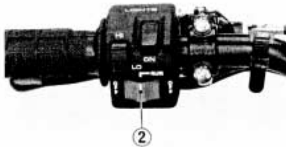
(2) Ignition switch