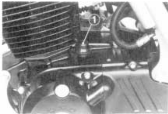
(1) Rubber cap