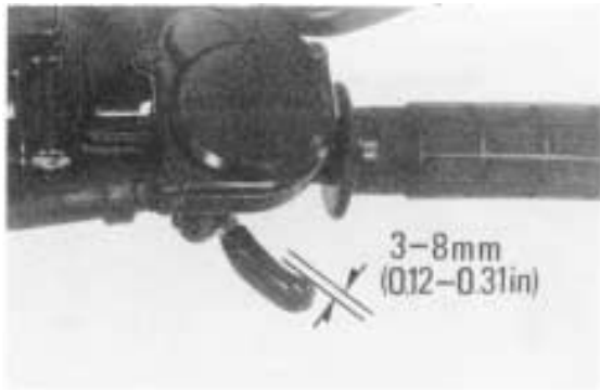
(1) Throttle lever

Free play, measured from the forward edge of the throttle lever (1) should be maintained at 3–8 mm (0.12–0.31 in). The cable adjuster (3) is located near the throttle lever. Loosen the lock nut (2) and turn the adjuster to obtain the correct free play.