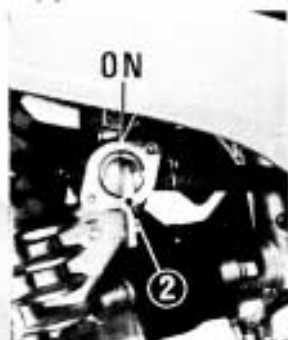
(2) Fuel valve