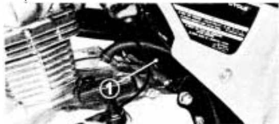
(1) Carburetor drain tube