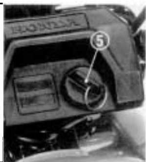
(5) Ignition switch