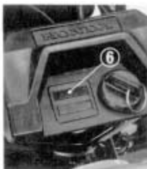
(6) Neutral indicator lamp