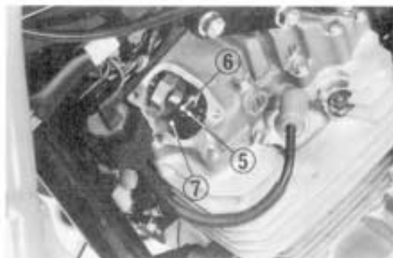
(5) Lock nut (7) Feeler gauge (6) Adjusting screw