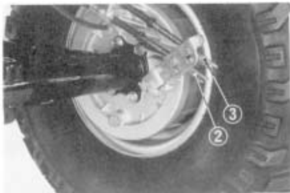
(2) Brake pedal adjuster

Make sure the brake arm, spring, and fasteners are in good condition.