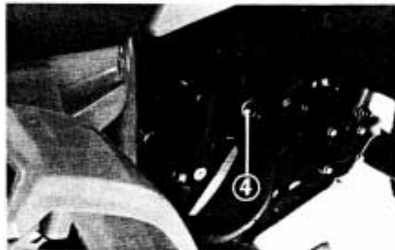
(4) Kick starter