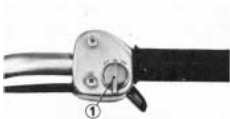
① Ignition switch

The ignition switch ① is on the right handlebar. Turn the switch to ON when starting the engine and to OFF to stop the engine.