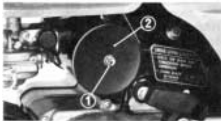
① Bolt ② Air cleaner cover

Never use gasoline or low flash point solvents for cleaning the air cleaner element. A fire or explosion could result.