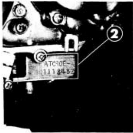
② Engine serial number