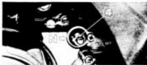
④ Neutral indicator