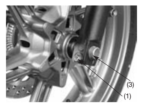
(3) Front axle

Do not depress the brake lever when the wheel is off the motorcycle. The caliper piston will be forced out of the cylinder with subsequent loss of brake fluid. If this occurs, servicing of the brake system will be necessary. See your Honda dealer for this service.