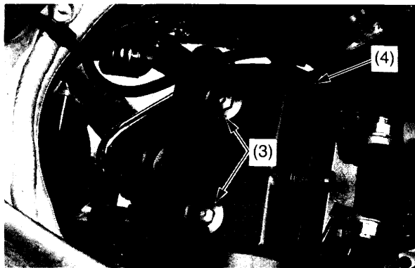
(3) cylinder head cover bolts/rubber seals (4) cylinder head cover