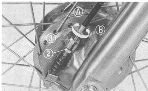
② Lock nut