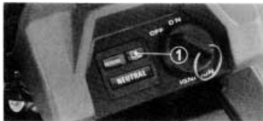
(1) Engine oil temperature warning lamp

A heavy duty cooling fan is available as an optional part to provide more air flow through the radiator under adverse condition.