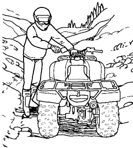
Be sure your legs are clear of the wheels.

If the hill is not too steep and you have good footing, you may be able to walk the ATV back down the hill. Make sure your intended path is clear in case you lose control of the ATV.