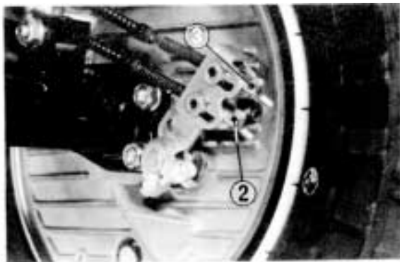
(2) Brake pedal adjusting nut (3) Brake lever adjusting nut

Make sure the brake arm, spring, and fasteners are in good condition.