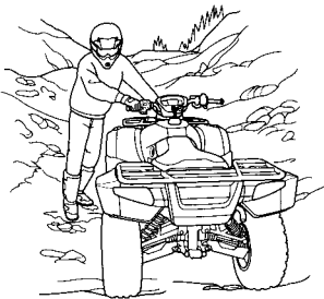
Be sure your legs are clear of the wheels.

If the hill is not too steep and you have good footing, you may be able to walk the ATV back down the hill. Make sure your intended path is clear in case you lose control of the ATV.