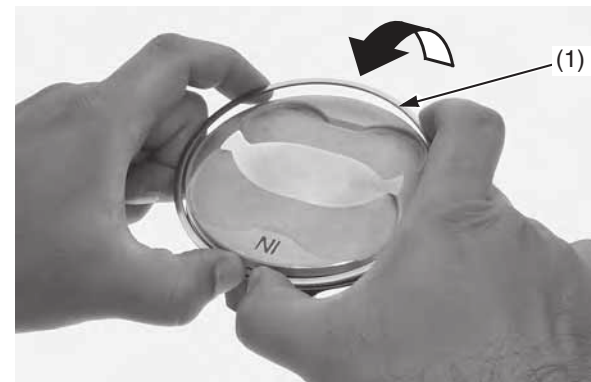
(1) piston ring

Do not damage the piston ring by spreading the ends too far.