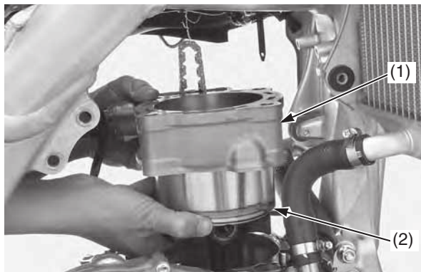
(1) cylinder (2) piston

Do not let the cam chain fall into the crankcase. Do not pry on or strike the cylinder.