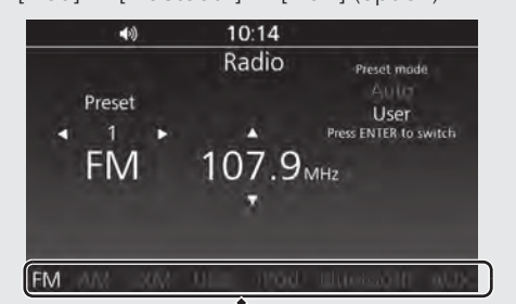
____ Information bar

Press _{\mathbb{Q}^{\times}}^{\text{SOURCE}} switch to change the audio mode. Cycles through the audio modes on the information bar as follows: [FM] \rightarrow [AM] \rightarrow [SXM] (option) \rightarrow [USB] \rightarrow [iPod] \rightarrow [Bluetooth] \rightarrow [AUX] (option)