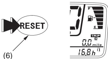
(6) RESET button

To reset the tripmeter to zero, press and hold the RESET button (6) for more than 2 seconds with the display in the tripmeter A or tripmeter B mode.