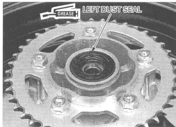
LEFT DUST SEAL

Install the brake disc with its "DRIVE" mark facing out.